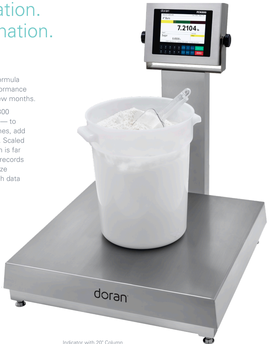
Indicator with 20" Column and DXL Series SS Scale Base.

Throughout the weighing process, the FC6300 provides real-time data for real-time control — to lower ingredients costs, eliminate bad batches, add operator accountability and find efficiencies. Scaled formulas are saved as a digital record, which is far more accurate than the typical handwritten records used on most plant floors. Search and analyze production data quickly, and retrieve all batch data of a specific lot ID.