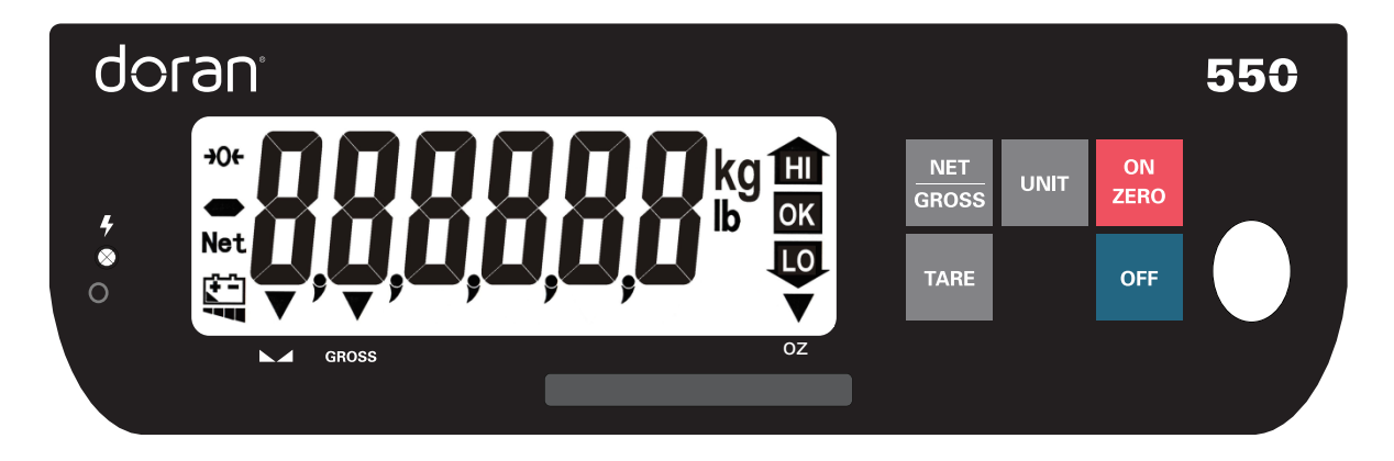
Fig. 1: Front Panel

This section contains information and instructions for basic scale operation.