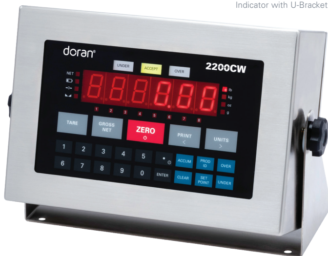
Indicator with U-Bracket.

Prompts and process control for measuring ingredients and ensuring user-defined tolerances are met for each ingredient every time. An auto learning setpoint feature compensates for changing process inputs and the system can interface with existing load cells. The 2200CW provides precision measurements from .01g to 100,000 pounds