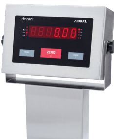
7000XL SS Series