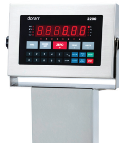
2200 SS Series