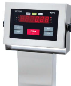
4300 SS Checkweigher Series