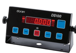
DS100 Indicator (Standard)