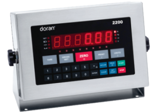
2200 Indicator (Optional)