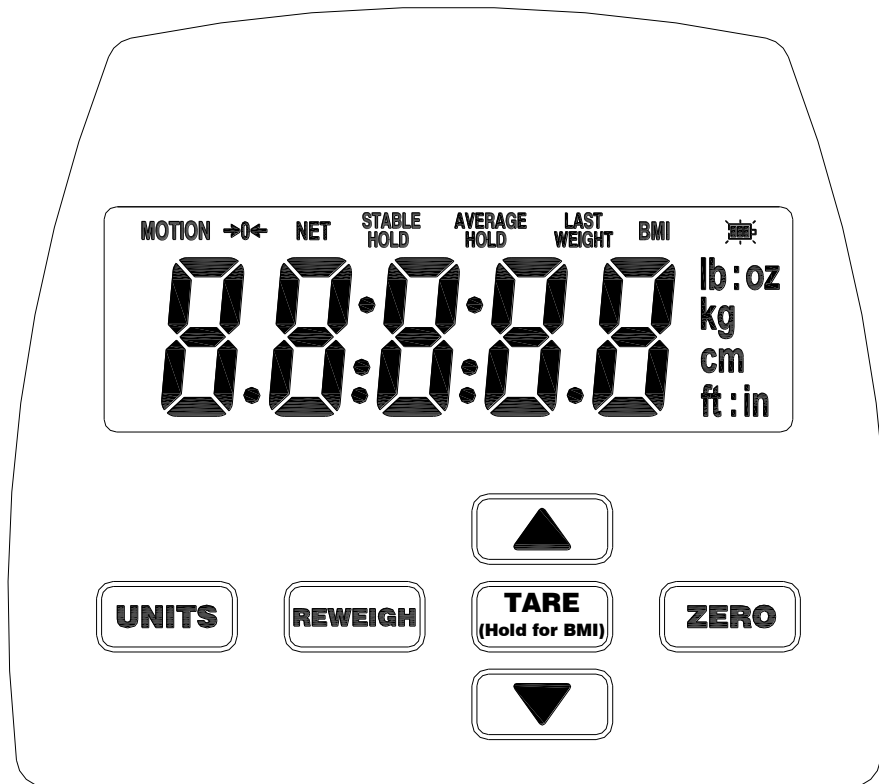
Fig. 3 Front Panel